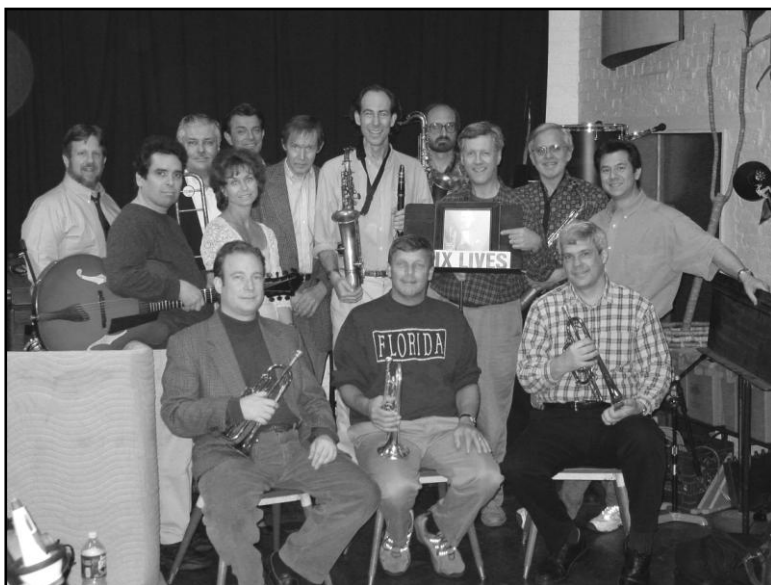
The Bix Centennial All Stars - "Celebrating Bix":