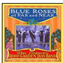
Dan Levinson's Roof Garden Jass Band: Blue Roses of Far and Near (2000)