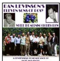
Dan Levinson's Eleven Sons of Rosy: Where the Morning Glories Grow (2002)