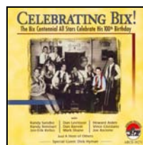
The Bix Centennial All Stars: Celebrating Bix! (2003)